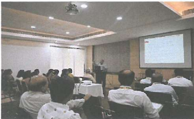
Session-III: NBA accreditation: Evaluator's perspective