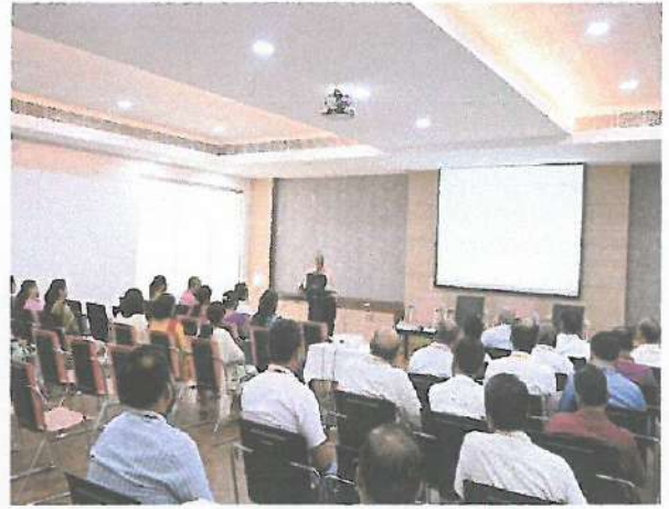
Session-II: OBE through NBA perspective