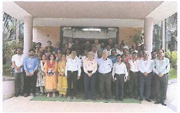
Glimpses of the Seminar