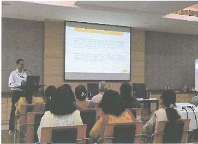
Session-I: Revised NBA SAR framework