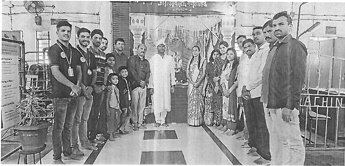
31/08/2022 – Shree Ganesh Murti Agaman & Murti Staphana