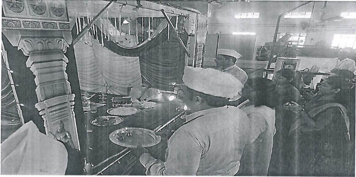
05/09/2022 – Shree Ganesh Aarti by Hon. Director