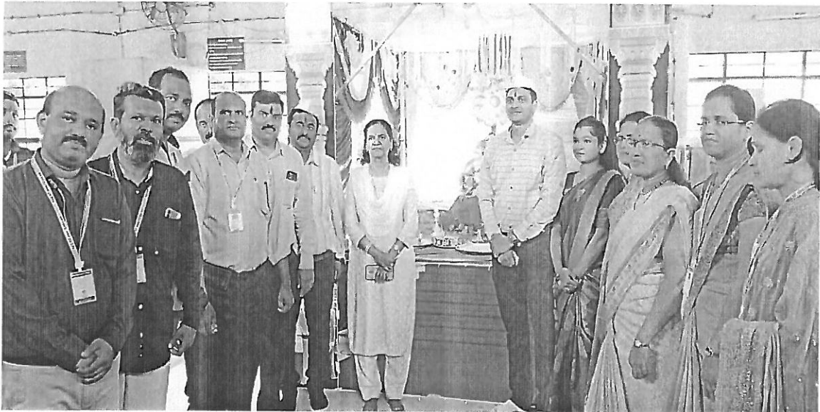
05/09/2022 – Shree Ganesh Aarti by Hon. Director