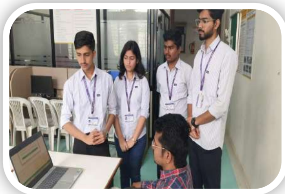
Interaction with students