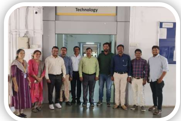
Interaction with faculties